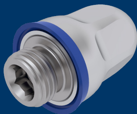
3028 | Straight screw-in connector in hygienic design