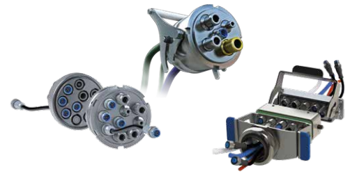
MULTILINE ADAPTIV / E